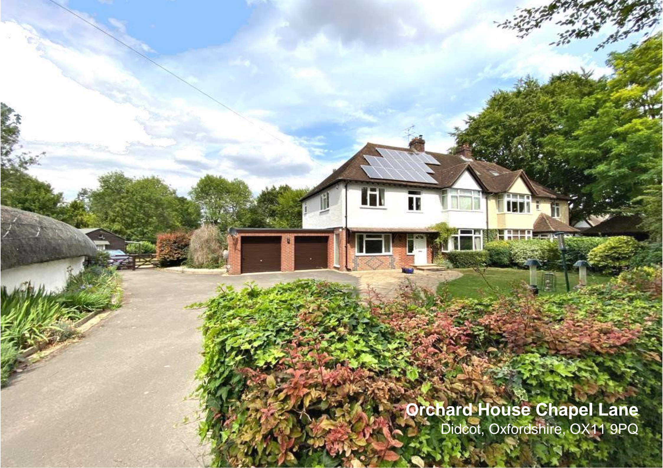
Orchard House Chapel Lane Didcot, Oxfordshire, OX11 9PQ